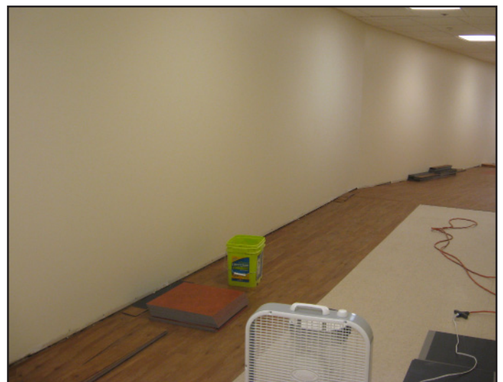
New flooring was installed in the "tunnel" (Building 6, Level 1) earlier this month.

Final touches, including the bench above, are being made to the bay window area. Please refrain from placing items such as plants along the windowsill as this will obstruct the view that is to be enjoyed by all.