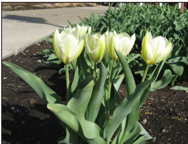
Tulips are now blooming in the Asbury Circle.