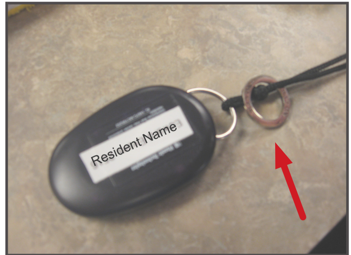
The “NO CPR” charm appears similar to a ring and will fit behind residents’ Spyder pendants.

We respect and honor each individual’s choice in this matter. Asbury’s policy and procedure will clearly state to look for the charm on residents so that all are aware and can best react to honor individual wishes.