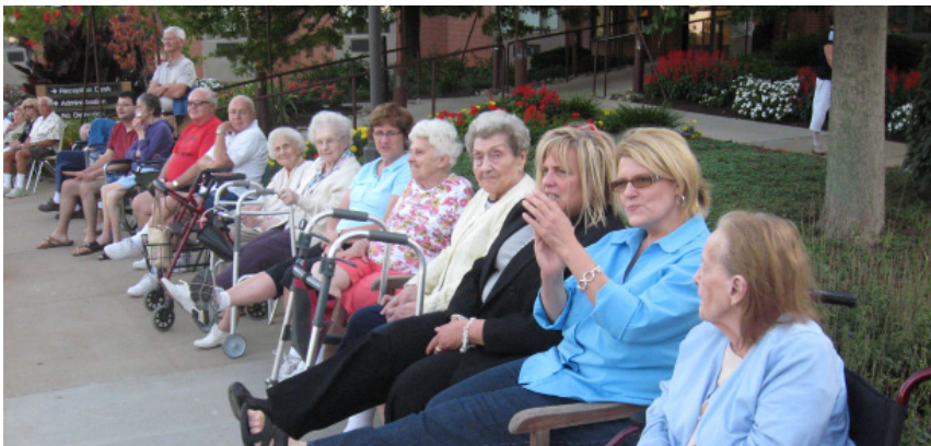
Top: Residents and neighbors gather for Hopewell Community Jazz Band on July 27.