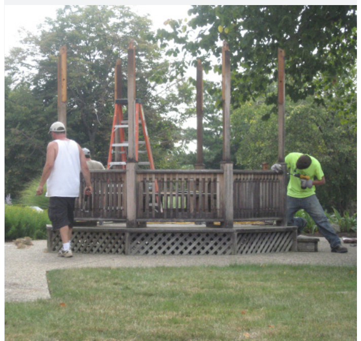
Workers dismantled the old gazebo on July 29.

This is also a fundraising project. If you would like information on how you can support this special initiative, please contact Asbury Foundation at 412-571-5106.