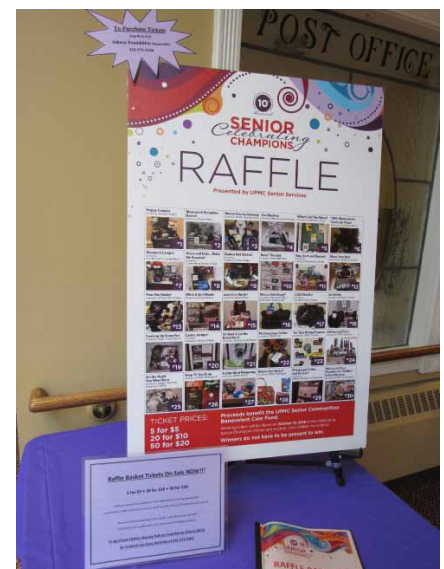
The Raffle Basket Poster and Booklet are now in the Mall.

Winners do not have to be present to win.