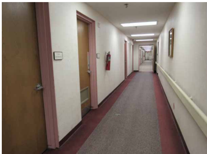
Hospice services will be available in Building 6, Level 2 beginning in January 2019.

Campus-wide improvements and projects are occurring with Asbury's affiliation with UPMC Senior Communities. Keep reading The Asbury News for the latest renovation plans.