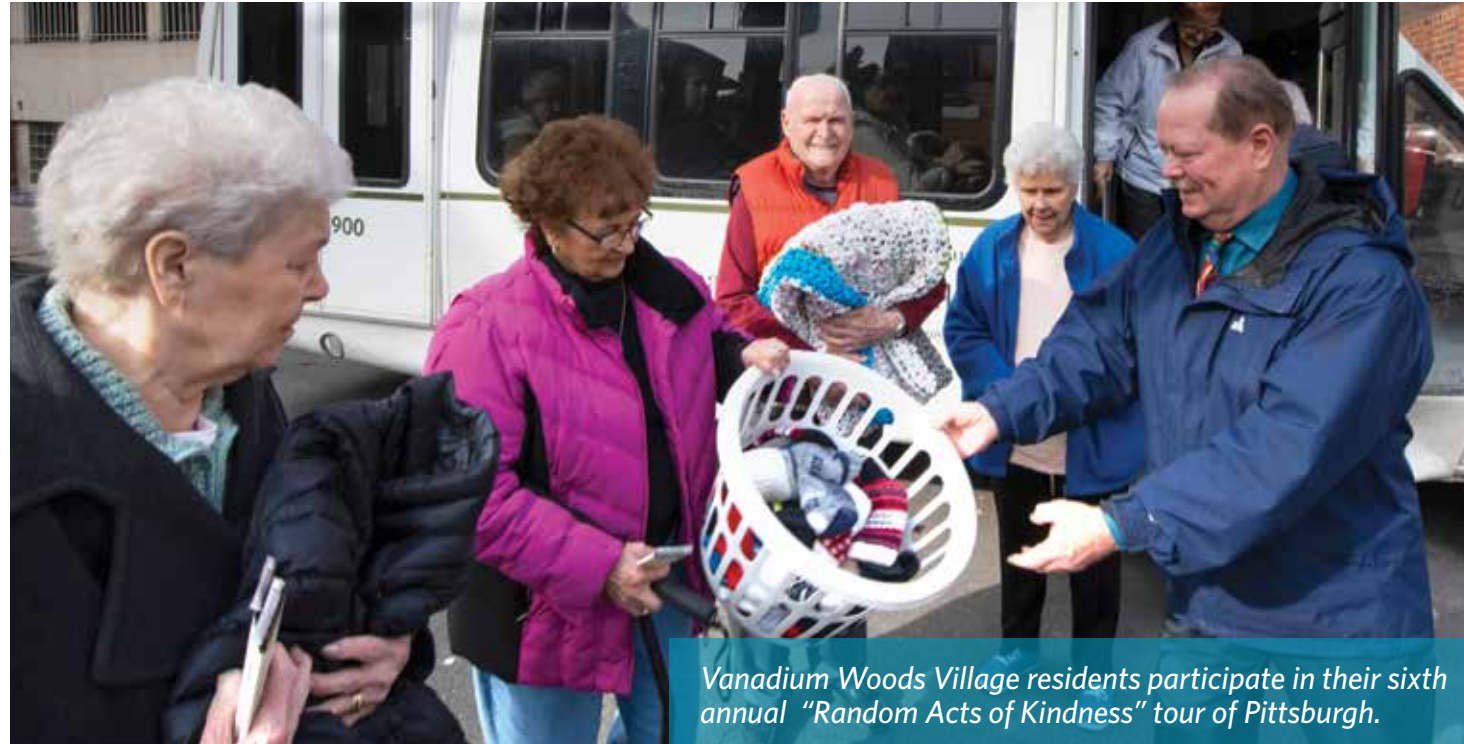
Vanadium Woods Village residents participate in their sixth annual "Random Acts of Kindness" tour of Pittsburgh.

Residents at Vanadium Woods Village, an independent living facility in Bridgeville, recently participated in their annual 'Random Acts of Kindness' trip, now in its sixth year. The residents visited the Salvation Army, Wellspring Mission, and Light of Life Mission to deliver clothes, monetary donations, and to spread good will.