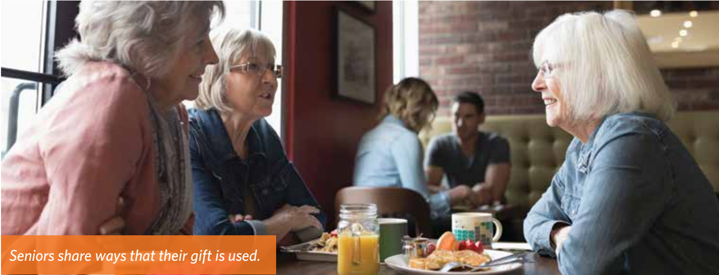
Seniors share ways that their gift is used.

As a registered 501(c)(3) non-profit organization, UPMC Senior Communities relies on philanthropic gifts to further the mission of delivering quality, affordable care and services to those we serve. UPMC Senior Communities is committed to providing a safe and welcoming home to older adults where they may remain active and independent for as long as possible and have easy access to nationally recognized health resources if their care needs change. Most importantly, this commitment extends to our long-time residents who are depleting their life savings and have limited funds.