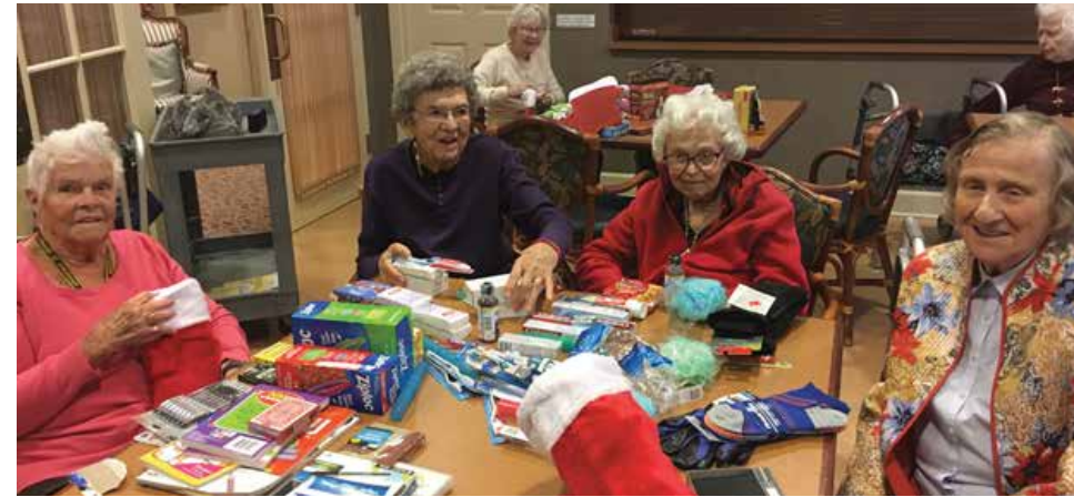
Residents stuff "Stockings for Soldiers" at Asbury Villas personal care facility in Mt. Lebanon.

Residents of Sugar Creek Station, a skilled nursing and rehabilitation facility located in Franklin, create Valentine's Day notes and cards for troops overseas – a project they have aptly named 'Valentines for Veterans'.