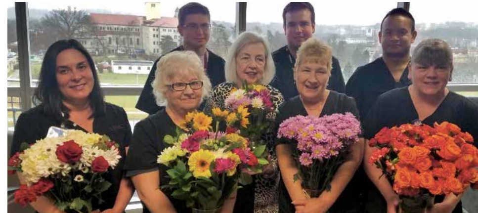
Cumberland Woods Village residents collect vases for UPMC Passavant for distribution of donated flowers to patients.