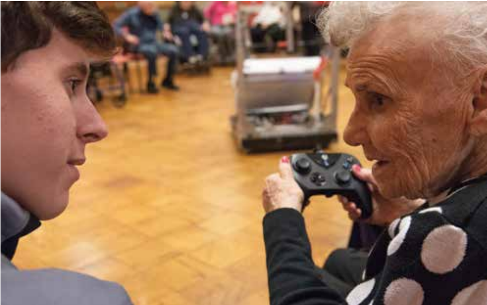
Students from the award-winning North Catholic High School Robotics Team provided a demonstration to the delight of Sherwood Oaks residents.

The residents of Sherwood Oaks were visited by the North Catholic Robotics Team for a demonstration of a robot the students built for a national tournament.