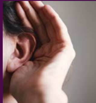
P. 4 Hear for You