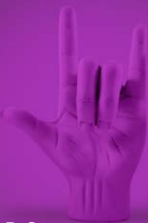
P. 6 Where Actions Speak Louder Than Words