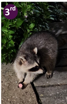
Timmy (Clarissa Spahr)