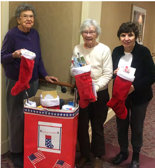
Stuffing stockings to be given to soldiers and their service dogs

Our Residents and Staff know the importance of giving back to our community. In 2018, many volunteered their time, talent and resources in support of not only Asbury Heights but many other causes as well.