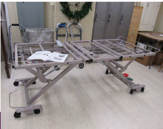
Residents of the Redwood Community have received new beds.