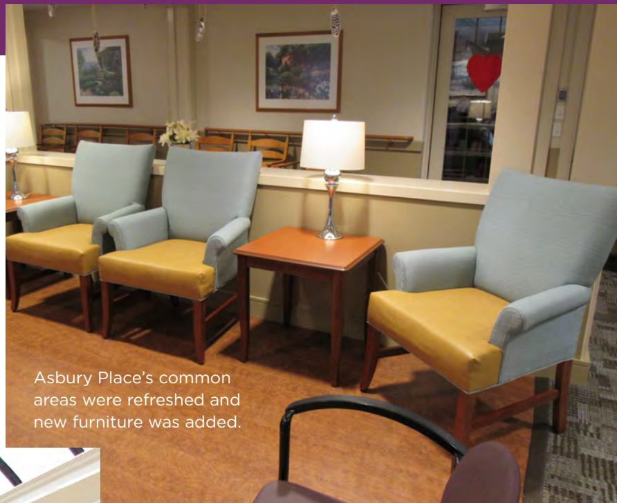
Asbury Place's common areas were refreshed and new furniture was added.

Over the past few months, various improvements to our campus have been made possible thanks to the resources provided through Asbury's affiliation with UPMC Senior Communities and our Asbury donors. Here are a few things that have been completed to revitalize our campus: