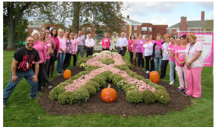
PINK – bringing support and awareness during Breast Cancer Awareness Month

We collected food for the Scouting for Food/Chow Wagon Campaigns to combat food insecurity.