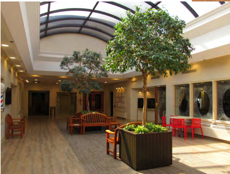
The Mall received fresh paint, new flooring, minor décor updates and increased lighting