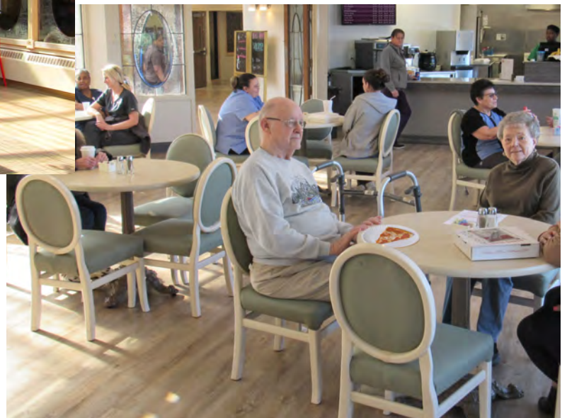
The Asbury Café is improved with all new equipment, plentiful seating and a tasty new menu.