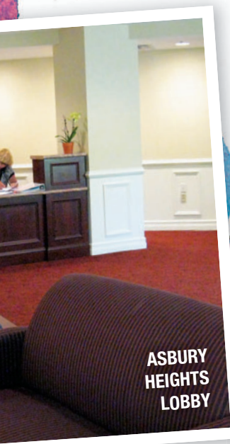
ASBURY HEIGHTS LOBBY

THE FIRST FLOOR OF BUILDING SEVEN was renovated this past fall and now features a bright common area dressed in pale greens and blues, reflective accessories and completely updated apartment homes. A small movie theater and outdoor patios are planned. ■